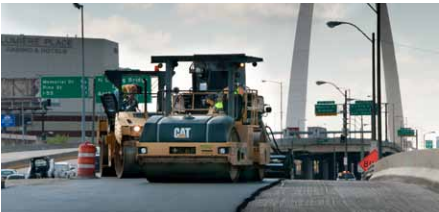
Road construction using warm-mix asphalt

“A review and accountability meeting, attended by over 150 managers and employees, is held quarterly to report and discuss the results of the metrics.”