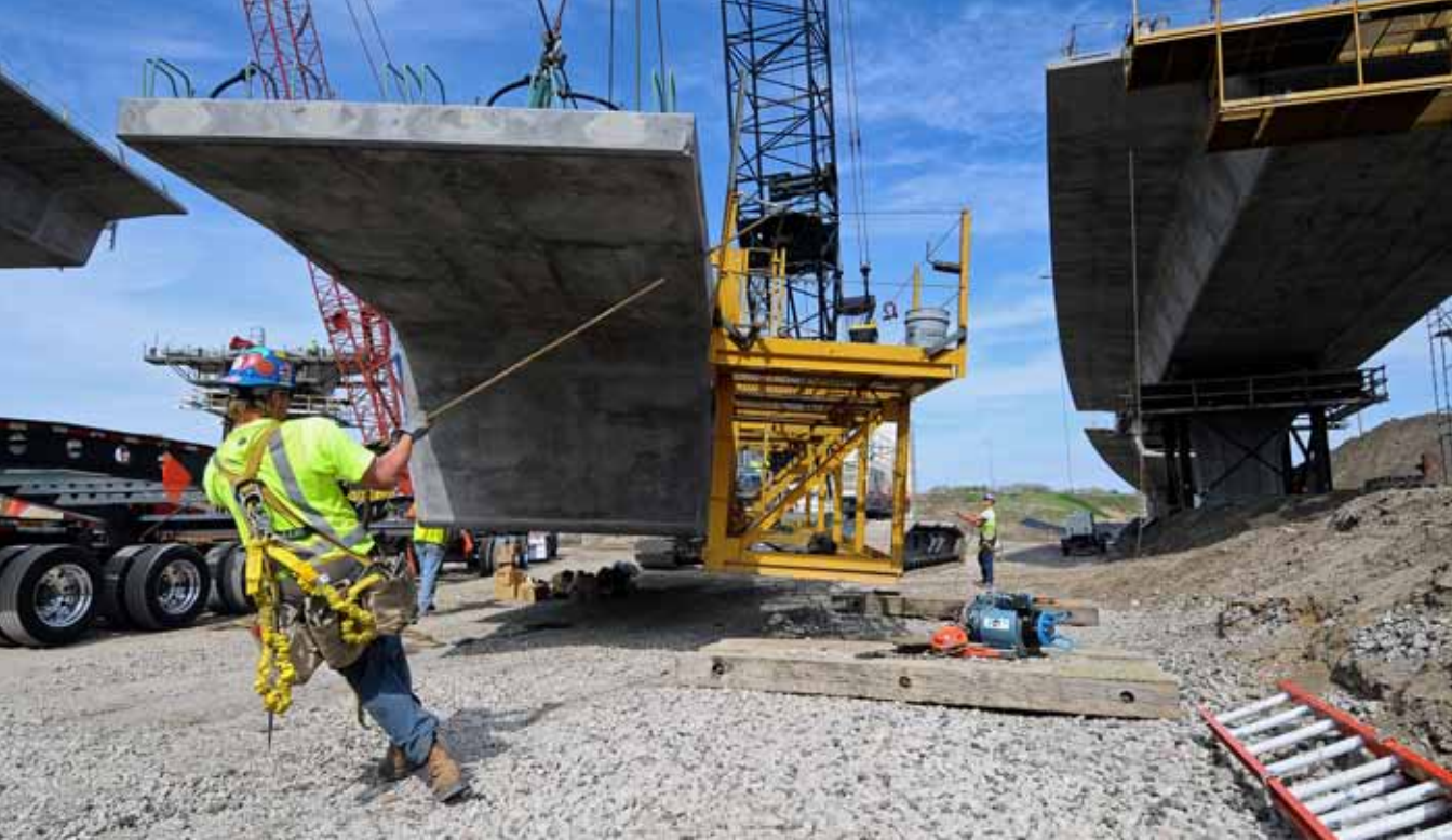
Precast section brought into position Hwy 62 Minneapolis, MN